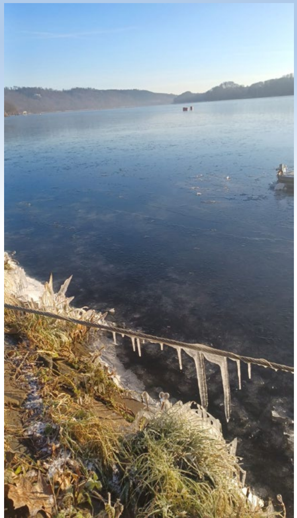
Baldeney-Lake on January 11, 2026

The J/22 Winter Series 2025/2026 took place on five dates: November 23, 2025, December 14, 2025, January 11, 2026, February 8, 2026, and March 1, 2026. The regattas were organized by ETUF Essen. This allowed sailors to gain competitive experience and foster a sense of community even in winter. Unfortunately, the event on January 11 had to be canceled due to low temperatures and the frozen lake.